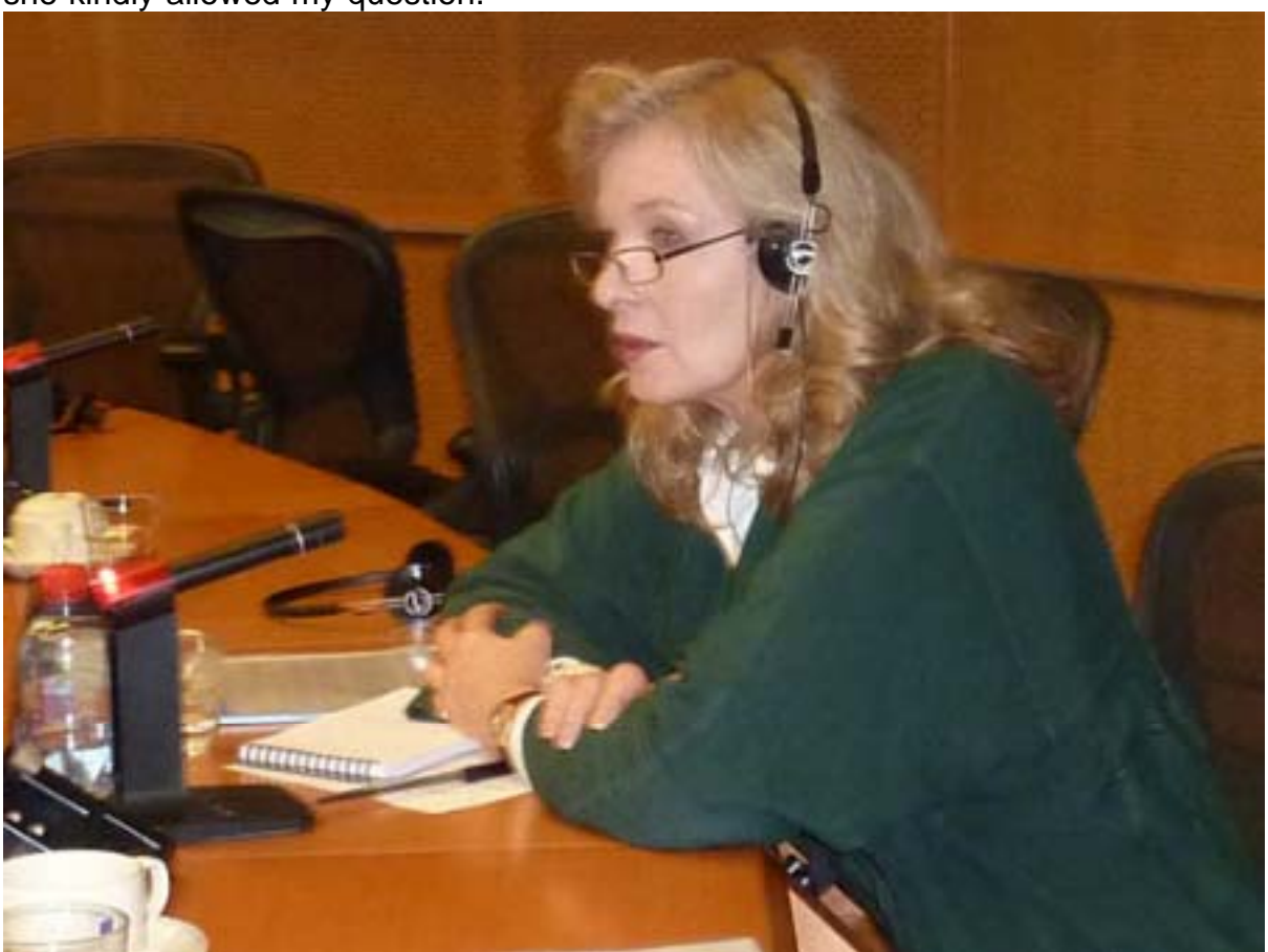
My exposition and question was precisely this:

The conference over-ran by half an hour and so the Armenian chairwoman then declared there was no time for questions because the room had to be vacated and the interpreters dismissed. Nevertheless I held up my hand and seeing it was solo she kindly allowed my question.