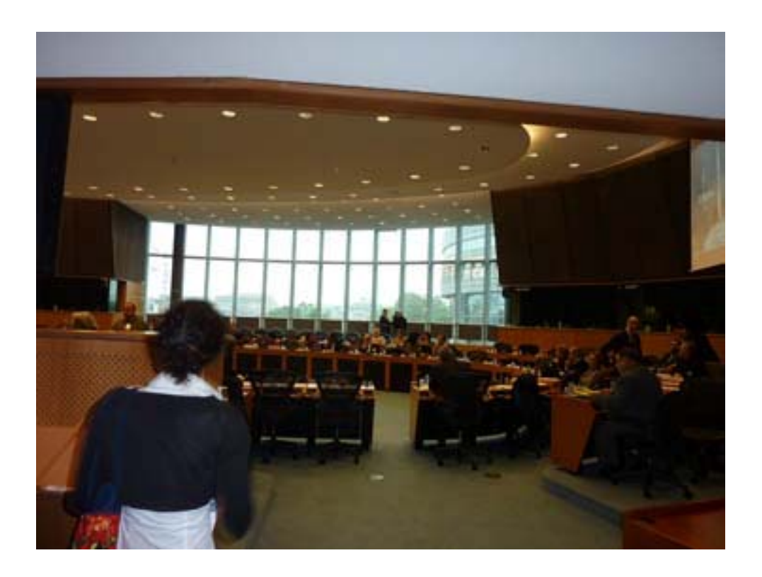
This is the 'aquarium' conference scene, a corner of the interior of the European Parliament in Brussels.