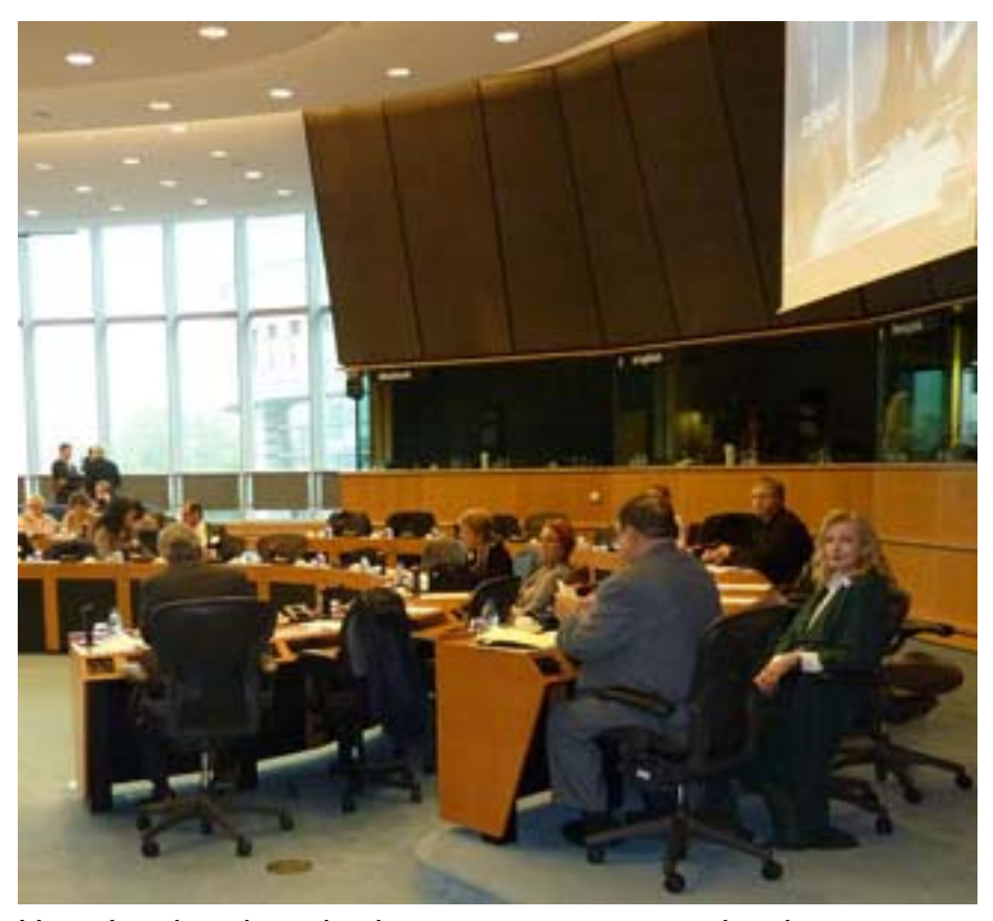
Here I swim alone in dangerous waters as the three groups gathered: the duped