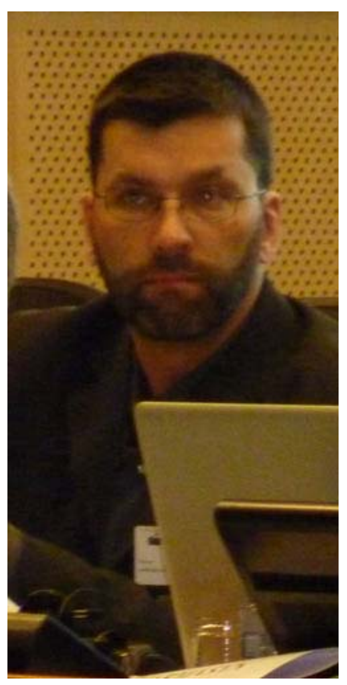
Mr Abramowicz defines two types of denial: