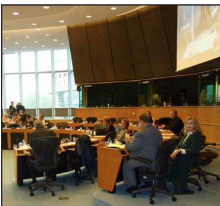
caption: Here I swim alone in dangerous waters as the three groups gathered: the duped dolphins, the dolphins as mimetic sharks, and their school of learned sharks.

Nine speakers in all present their specialist arguments for entertainng the oxymoronic notion of denial and democracy and of these the three keynoters are: