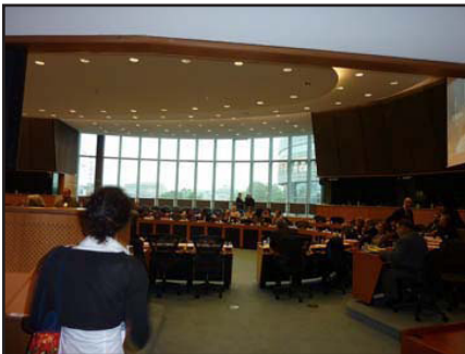
caption: This is the ‘aquarium’ conference scene, a corner of the interior of the European Parliament in Brussels.