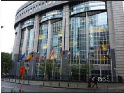
caption: The location of that ‘tower of babel’, the European Parliament complex, Brussels in Belgium.

During the afternoon of 6th October 2009 a conference on DENIAL AND DEMOCRACY IN EUROPE was held in the European Parliament, Brussels. It was sponsored by the Centre Communautaire Laïc Juif (a Jewish body), the European Armenian Federation and IBUKA-France (an African body) under the patronage of the European Member of Parliament Mr Elmar Brok. I attended as a delegate - a delegate behind enemy lines, as it were, for I firmly denounce the conflating of oxymoronic ideas as bogus advertising for which in my view the European Union law-makers are retail experts.